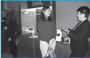
Left: A representative from Summit Academy discusses the school's program with an interested parent.